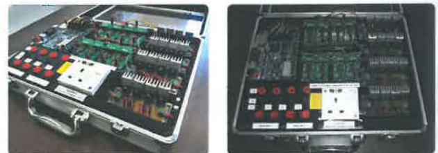
Figure 2: Single Phase Cascaded Multilevel Inverter