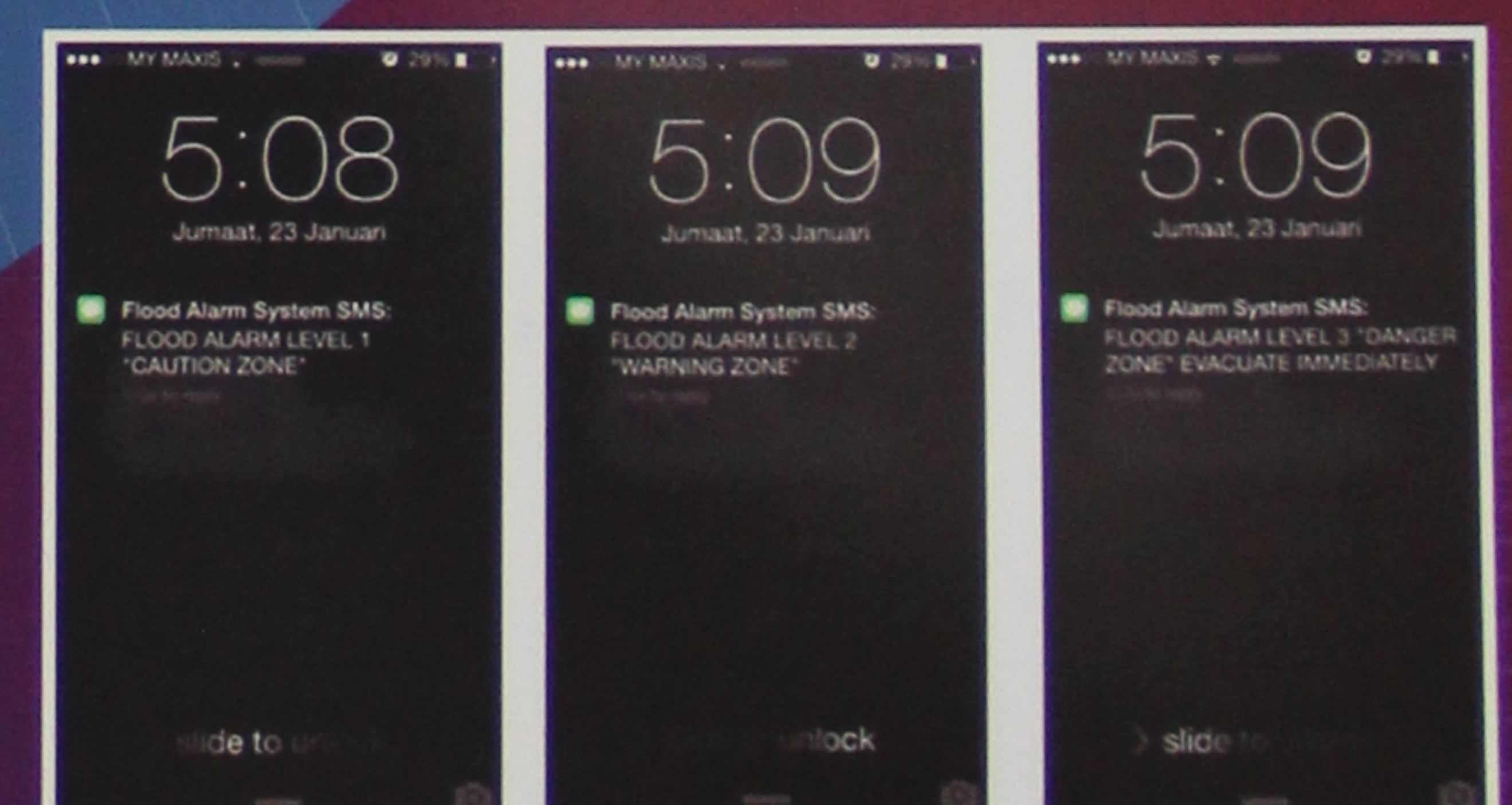
Notification Flood Alarm Level