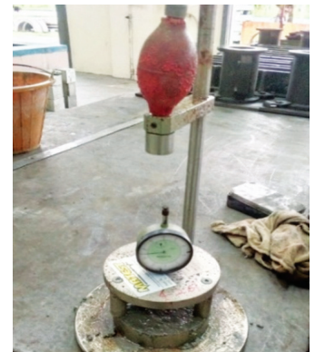
Figure 6: Dropping Ball Test Apparatus

The dropping ball apparatus, as shown in Figure 6, was used to perform the mortar consistency test and under (British Standards Institution BSI, 1980). A consistency of approximately ± 1mm was used for the 1:3 designation mortars. The calculation of the result is using the formula as follows: