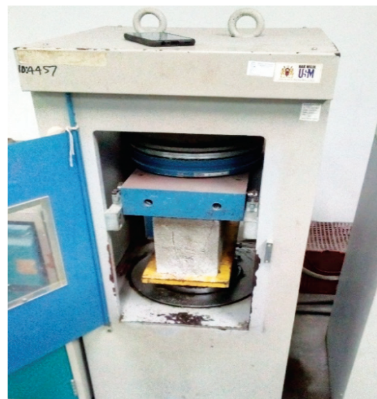
Figure 3: Compressive Strength Machine

A = average of the gross area surfaces of the specimen (mm 2 )