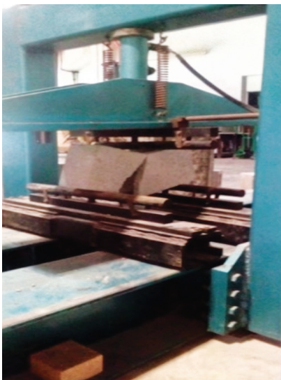
Figure 4: Flexural Strength Test

An object's modulus of rupture (or flexural strength) is the maximum amount of force that it can withstand before breaking or becoming permanently deformed. Flexural strength can be measured in two very similar ways. The ends of a long rectangular sample of the material are supported, leaving no support in the center, yet the ends are solid. The material is then loaded or pressed until the central section is broken. An increasing load is delivered to the center of the sample during a three-point bending strength test until the material permanently breaks or bends. Increased forces can be applied while the force at the failure point is carefully recorded using flexural test equipment.