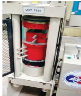
Figure 5: Mortar Compressive Strength

The mortars were cast in 50 mm × 50 mm × 50 mm molds as per (ASTM C 270-07, 2007, Khalaf, 2015) compressive strength of mortar standard test method. The mortar was cured for 28 days and 1.5 hours after mixing, the initial setting was removed. For the first 24 hours, the cubes were stored and covered with a polythene sheet before being removed from the mold and cured in water at 20°C for 27 days. To determine the relative density of the mortar, the cubes were weighed in both air and water. They were then loaded at 0.1N/mm 2 /sec to ascertain the mortar's compressive strength. The mortar cube during the compressive strength test is shown in Figure 5.