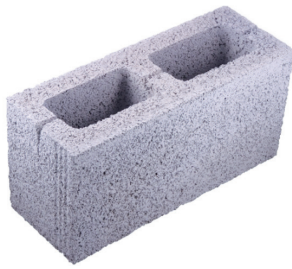
Figure 1: Masonry Hollow Block