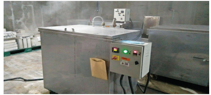
Figure 2: Boiling Machine Test