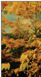
Figure 6: Late autumn copper and brown colours, a prelude to falling leaves