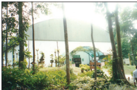
Figure 3: Lovely cool spring beginning with beautiful flowers

The function of the Integrated Data Acquisition with Monitoring System is to understand real time microclimate parameters and to control mechanical hardware to simulate the right microclimate for plant growing. The system consists of computer software programs, data loggers, parameter sensors and hardware actuators. The computer is programmed to automatically set all the environment parameters for each day of the four-season year, following the New Zealand climate. It is used to control air temperature, humidity, ventilation, refrigeration, defrost cycles, carbon dioxide enrichment, artificial lighting, irrigation and fertilisation, and performs data recording and analysis together with alarm detection. The microclimate requirement of Four