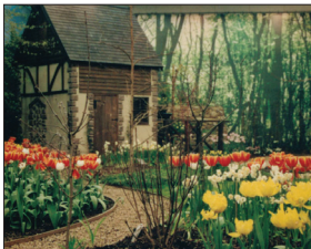
Figure 5: A pictureque temperate summer season in the tropics

During this season, most of the plants produce colorful flowers and fresh green leaves. The average day temperature is around 12°C and by night, 7°C. The light is on for 13 to 21 hours a day throughout this season. Spring is the season in which new growth begins and most plants burst into flower. Drifts of yellow Daffodils, Red Tulips and Muscari decorate the border of the lawns. Pink blossoms liven up the leafless