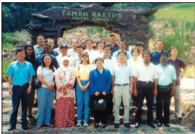
IEM members at the Cactus Garden, Malaysian Agricultural Park