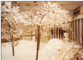
Figure 7: Where else can you get a winter dressed in clothes for the tropics

The most popular season among Malaysians, winter is the coldest season of the year. Winter days are short with less than 8 hours of daylight. The temperatures for both day and night will drop to as low as -5^{\circ}\text{C} and rarely rises above 5^{\circ}\text{C} . The garden will be enveloped in snow for two months. During this period, most of the trees remain dormant. These trees will spring into life again when the winter is over and temperatures get warmer. However, some plants will die, leaving their seeds for the next season. The evergreen Royal Bay trees and Chamaecyparis however will maintain its beauty over winter. The silver barked birches contrasting with the red-stemmed dogwoods adds some colours to the otherwise white Christmas winter scene. The