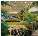
Figure 2: Front View of the Four Seasons Temperate House

as no fogging occurs even with rapid changing of temperature and humidity inside the chamber.