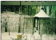
Figure 8: Thawing snow soon making way for the first of spring

The authors would like to thank the Management of the Malaysian Agricultural Park, Shah Alam and the MARDI for their generosity and permission to use their material in this report. ■