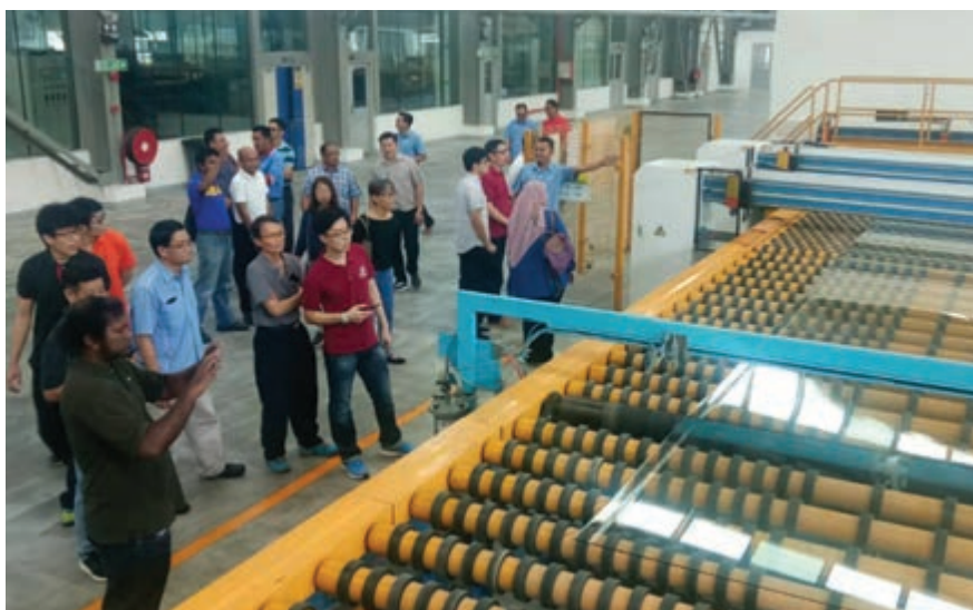
Participants touring production line

schematic diagram in Figure 2). The flue gas (residual gas) from the melting furnace remains at a high temperature of 600°- 700° Celsius. The waste heat recovery system recycles this flue gas to reheat the