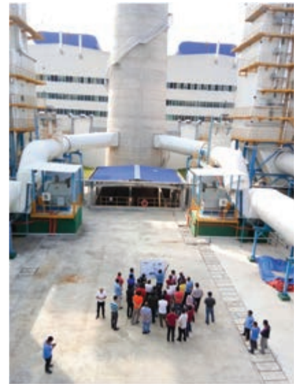
Touring the waste heat recovery system