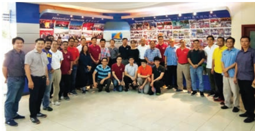
Participants of the technical visit to Kibing Group (M) Sdn. Bhd.