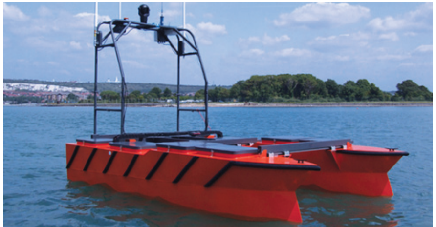
Example of an ASV platform

While Autonomous Underwater Vehicles (AUVs) have been widely used for many years, an increase in the use of ASVs, particularly for environmental monitoring, is more apparent than ever.