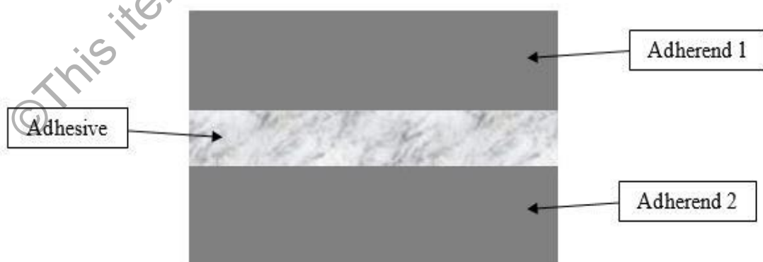
Figure 1.1: Illustration of adhesive bonding

Mechanical joining/bonding is the methods to assemble material to be a mechanical structure where it offers a series of choices for researchers to consider. To obtain a desirable outcome, a trade off exist between cost, performance and impression on the finish product's weight. The joining technique is vital to manufacturing decisions. The urge to find the best joining technique, joining knowledge and approaches were explored by many researchers every day which leads to the study of adhesive bonding technique. Adhesive bonding is becoming one of the popular joining approaches in metal industries since it provides a different solution over other conventional practices such as riveting, welding, bolting and soldering (Borsellino, Bella, & Ruisi, 2009). Adhesive-bonding is a joining process whereby materials are held together by the surface attachment of adhesives as illustrate in Figure 1.1.